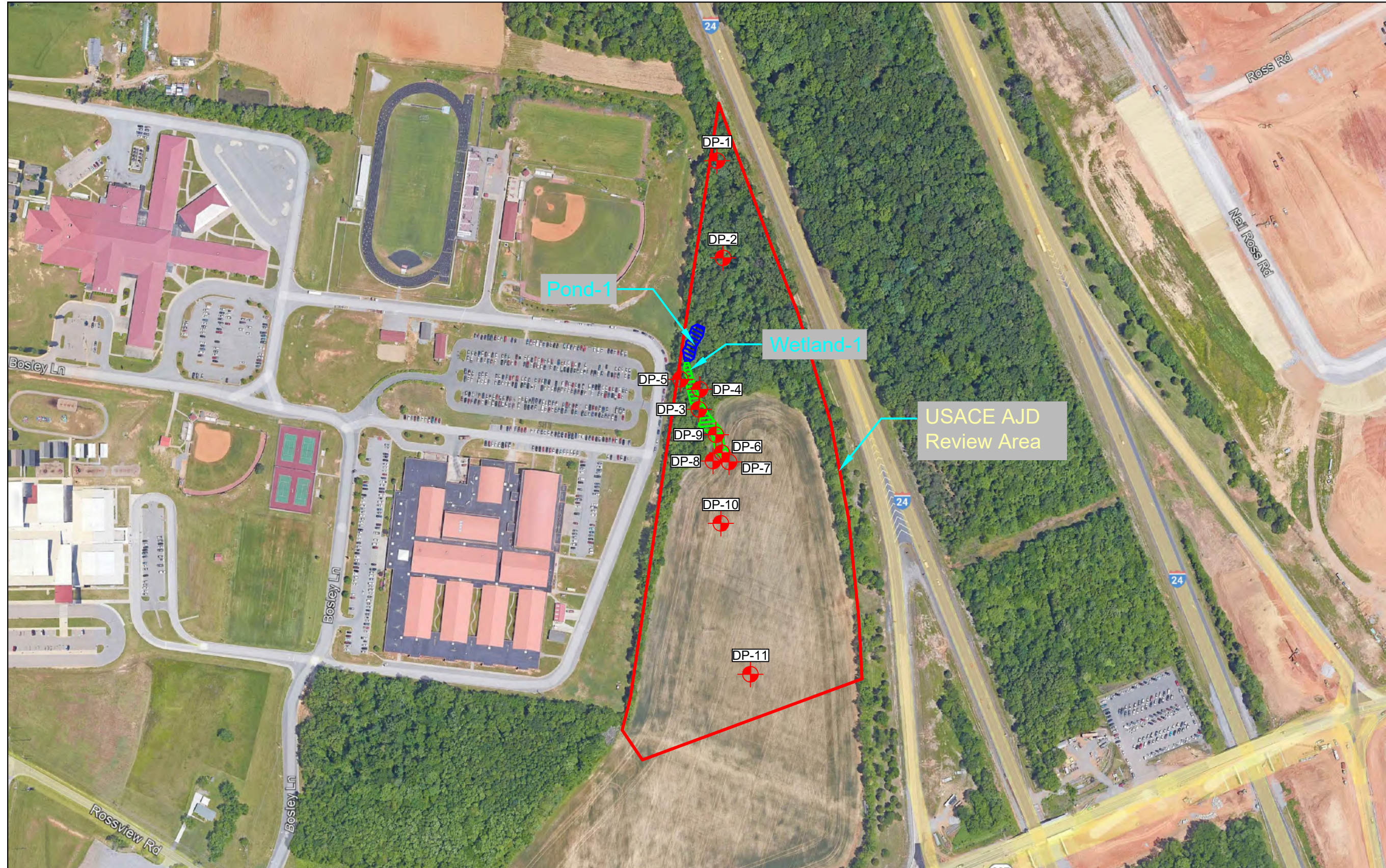
Aerial Source Provided by: Google Earth Pro, (05/10/2015)